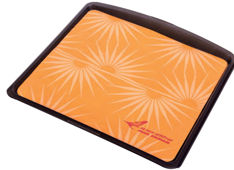
☰ Corner : Round Corner