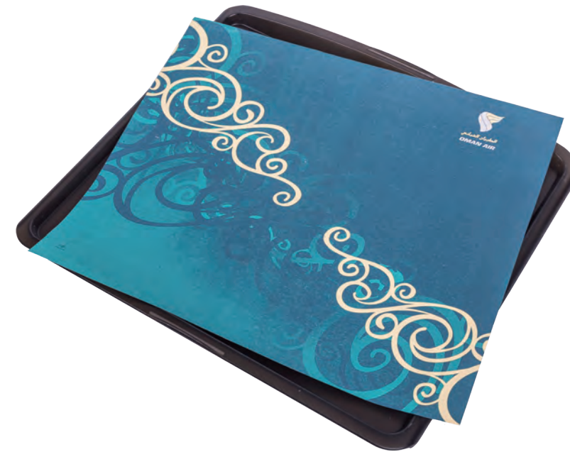
☰ Corner : Straight Corner